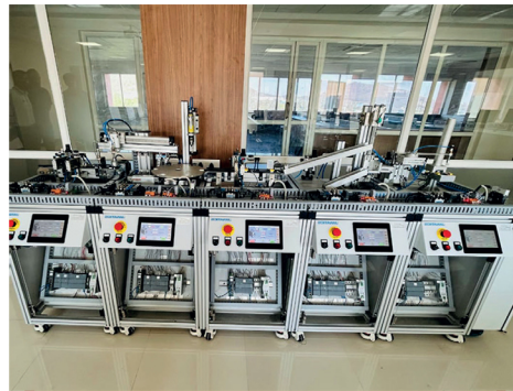
Robotics and Automation Lab