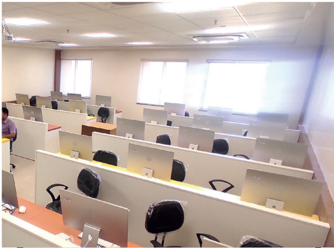
Computer Vision (IMAC) Lab