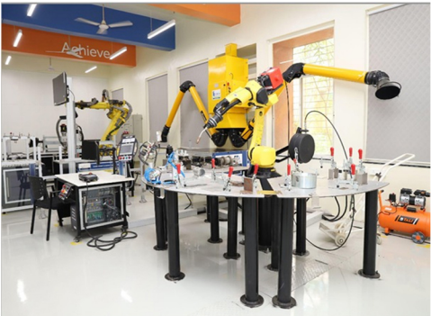
Bajaj Skills Lab