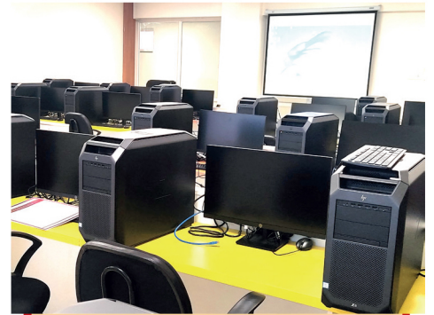
GPU Workstation Lab