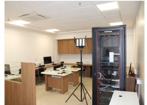
TCIL 5G Lab