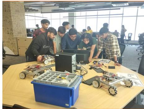
Infosys Makers Lab