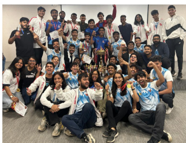
Champions in Sports