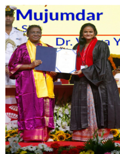
Gold Medal for Academic Achievement