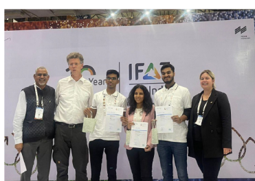
Winners at IFAT