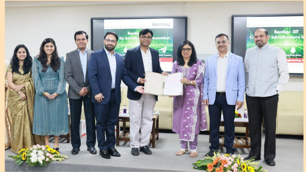
Bentley -SIT Centre for Infrastructure Innovation