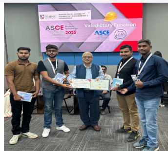
Award at ASCE Symposium