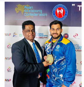
Excellence in Sports