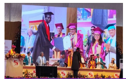
Gold Medal for Best International Outgoing Student at SIU