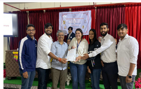
Award at ICI Competition