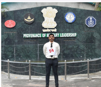
Selection in Indian Army