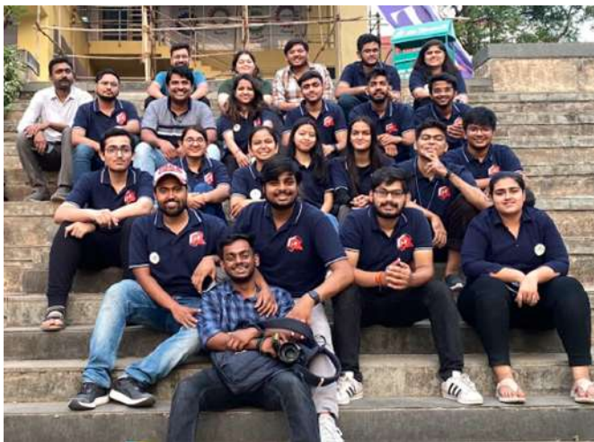
The Team that made it happen, Capomaestro -22