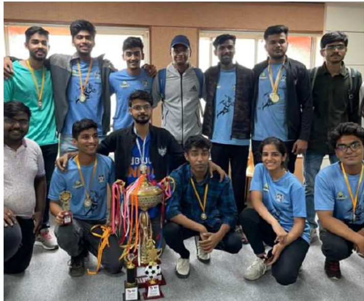
Congratulations to team Civil@SIT and team CSE@SIT.

Civil Engineering Department and Computer Science Engineering bags the overall Protathilitis (Annual Sports Event of SIT) Winner Trophy 2022!