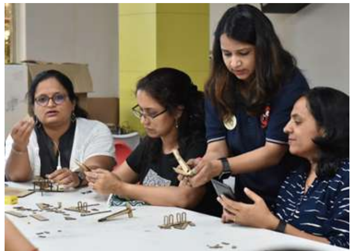
Faculty at the Laser Cutting Workshop