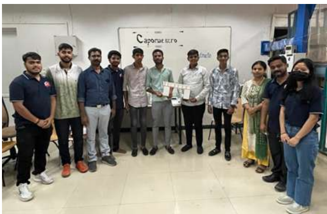
Constructo Event Team with the Winners