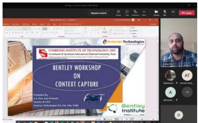
Bentley Workshop on Context Capture