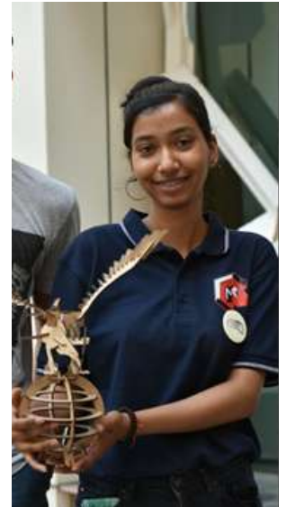
Laser Cutting Workshop